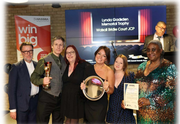
The Lynda Gadsden Memorial Trophy: Walsall Bridle Court Jobcentre were awarded The Lynda Gadsden Memorial Trophy for an outstanding contribution to charity.