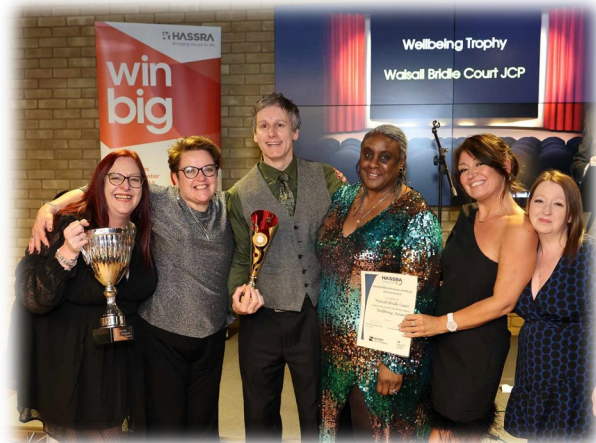
Wellbeing Trophy: Walsall Bridle Court Jobcentre were winners of the HASSRA West Midlands Wellbeing Trophy.