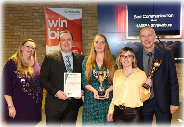
Best Communication: HASSRA Shrewsbury were winners of the West Midlands Best Communication Award.