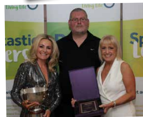
First Vice-President's Cup for Best Large Club Newcastle Pensions HASSRA (North East)