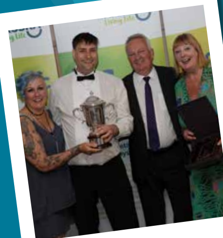
President's Cup for Best Association HASSRA West Midlands