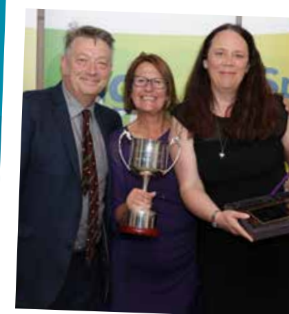
Sir Robert Devereux Trophy for Wellbeing Lincoln HASSRA (East Midlands)