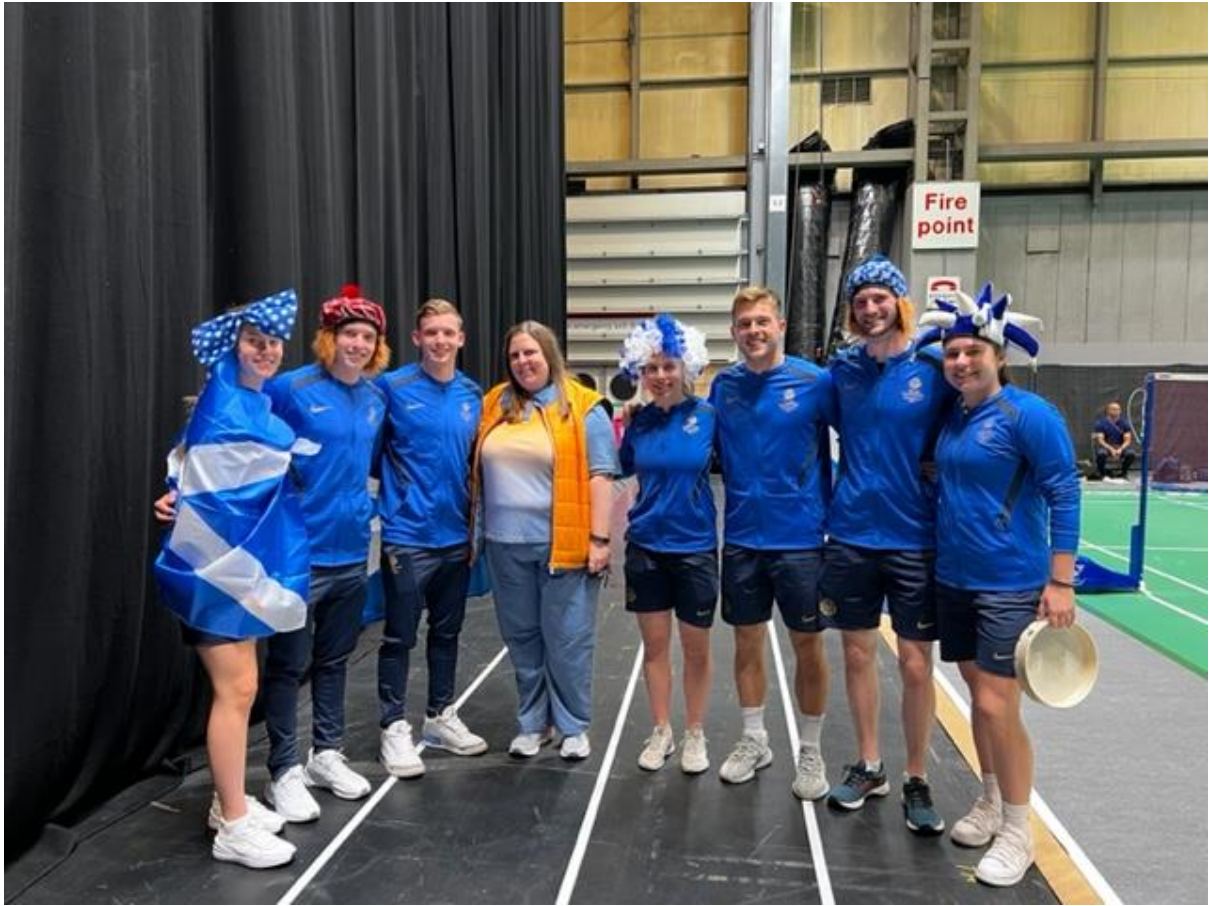
This is Team Scotland during the team competition. They went onto court in these hats when they were introduced to the crowd for fun and as volunteers we got to lead them out.