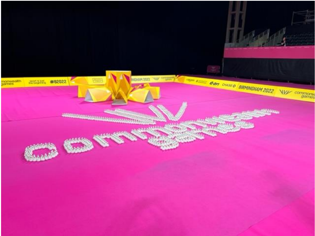
The sports equipment team spent 2 hours making this out of used shuttles!