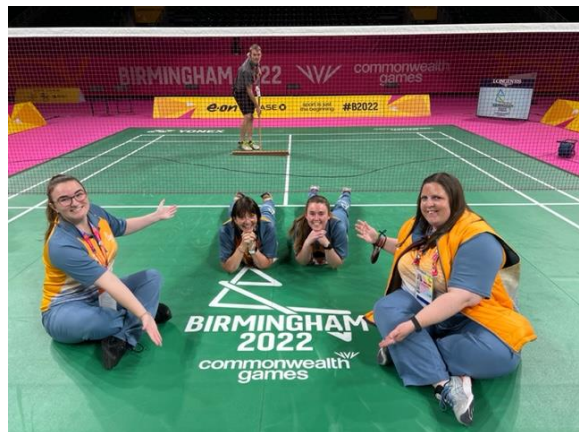
On the final day we were allowed to take photos on the show court