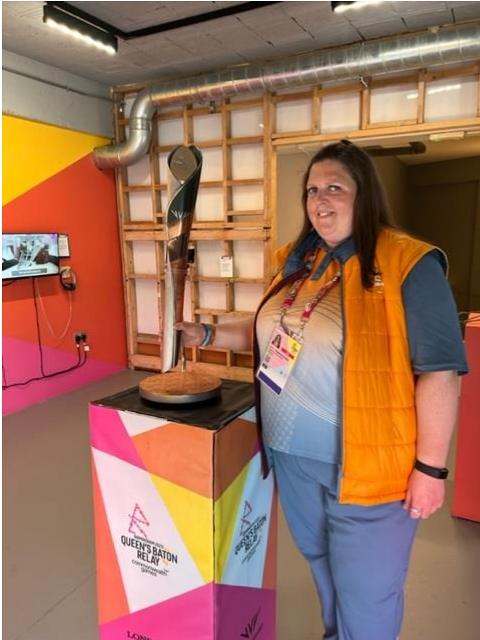
The Queen's baton was on display for free and I was really pleased to get to hold it and see it up close.