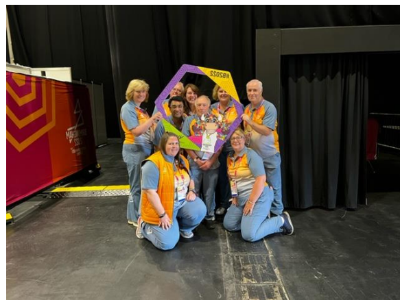
Team Athlete Services