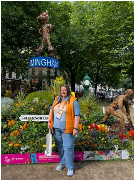
This flower display first appeared at the RHS Chelsea Flower Show in May this year and won a gold medal. I had also volunteered there so I was really please to see it again in Birmingham.