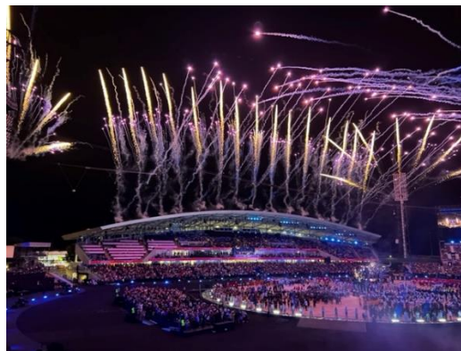
Opening Ceremony – Team England and the fireworks!