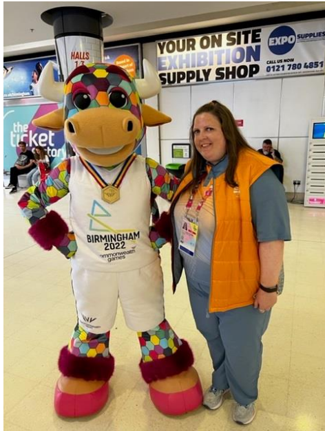
Here I am with Perry the mascot 😊

One of my favourite memories was meeting the Cook Islands team at the Lawn Bowls. I travelled to Leamington Spa for the day, and even though their women's trio lost to England they still looked happy to be there and even put on a performance of song and dance to the spectators which I will never forget.